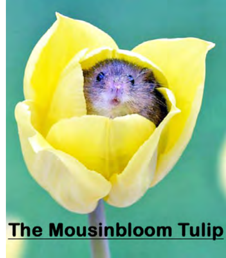
The Mousinbloom Tulip