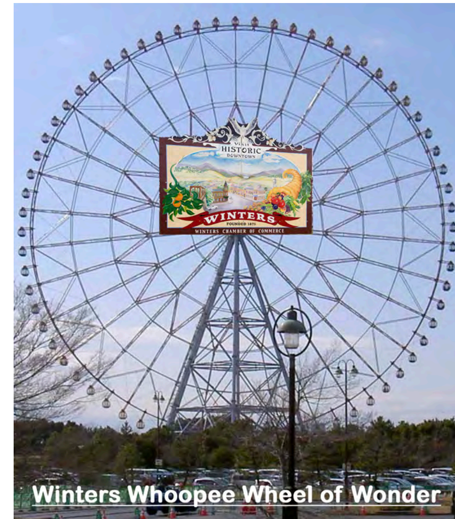
Winters Whoopee Wheel of Wonder