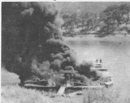
Flames and billows of thick black smoke

rise from the dock at Putah Creek Park Resort where five boats were destroyed last Wednesday afternoon. See the article for details.