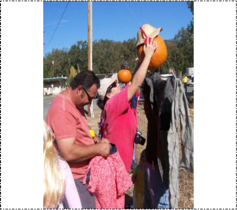
Capell Scarecrow Day- Family, Friends, Siblings & a cute dog all enjoyed the day!