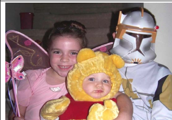
Shill's Grand Neices & Grand Nephew from L.A.